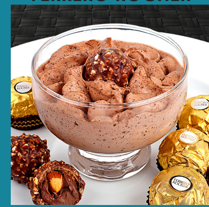
World famous rich Ferrero Rocher ice cream with thick chocolate sauce topped with Ferrero Rocher.