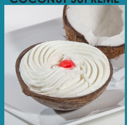
Cool & delicious coconut ice cream packed into a real half coconut shell. £6.90