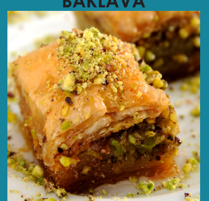
Rich, sweet dessert pastry made of layers of filo, filled with chopped nuts and soaked in syrup or honey. £6.90