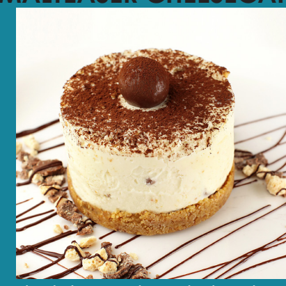
A malted cheesecake with chocolate chip cookie base, finished with a cocoa coating & garnished with chocolate Malteasers. £6.90