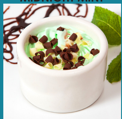
Luxurious dreamy mint flavoured ice cream, rippled with gorgeous chocolate sauce & topped with chocolate curls. £6.90