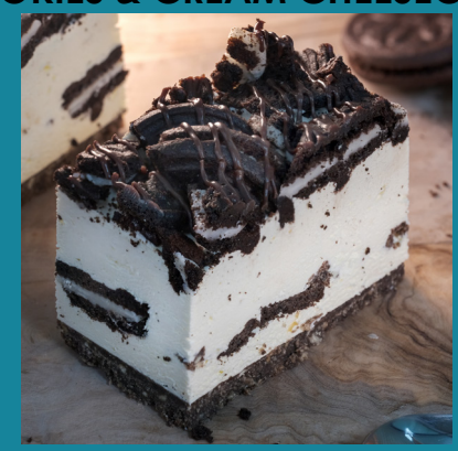
A classic cookies and cream flavoured cheesecake, studded with oreos & garnished with chocolate sauce. £6.90