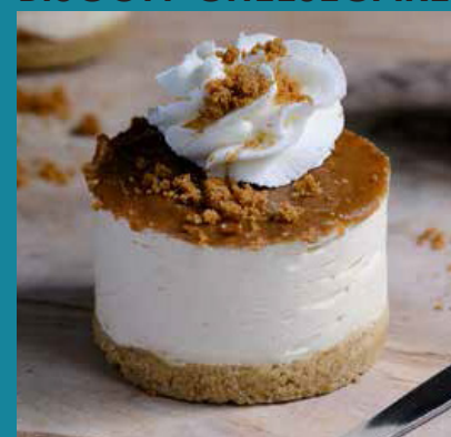
A delicious creamy cheesecake with a lotus biscuit glaze, garnished with lotus biscoff and a rosette of cream. £6.90