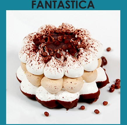
Vanilla & caramel ice cream, with chocolate balls, toffee pieces & caramel sauce. £6.90