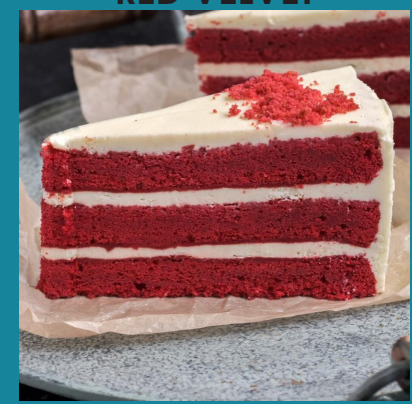
A classic red velvet sponge cake with layers of butter cream, that create that unforgettable taste.