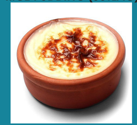
Baked creamy rice pudding. £6.90