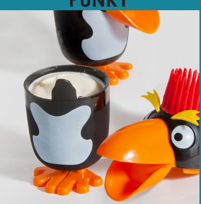
Delicious vanilla flavoured ice cream in a fun character toy. £6.90