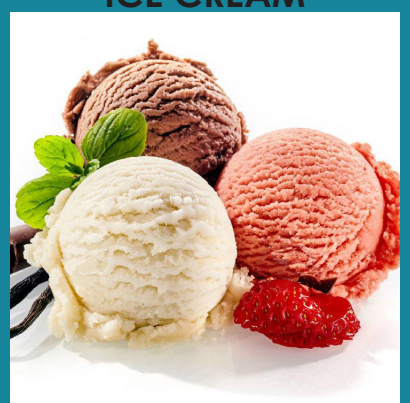
Choice of Vanilla, Chocolate or Strawberry. £6.90