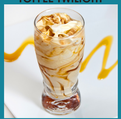
A combination of toffee & vanilla dairy ice cream swirled with toffee sauce & topped with toffee pieces.